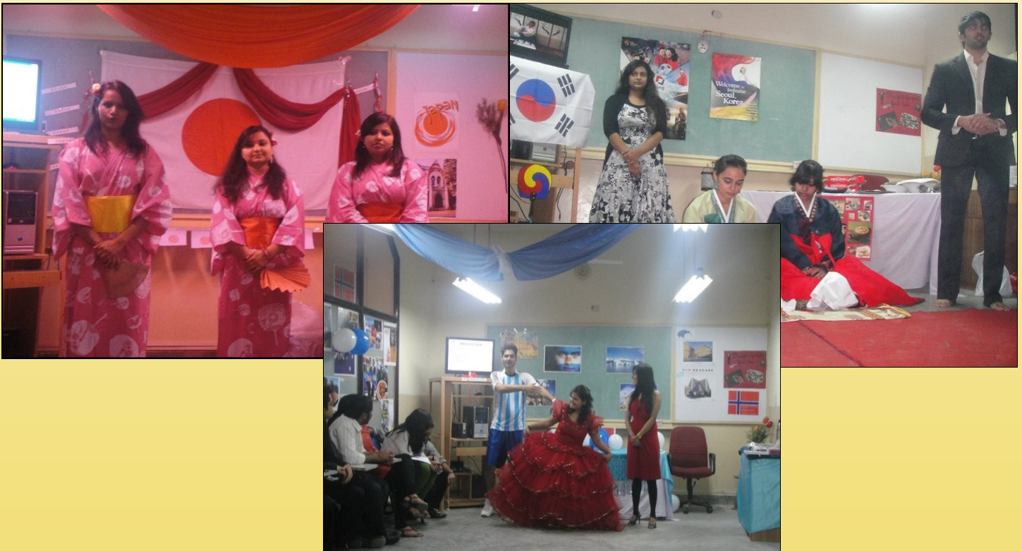
From left to right: The Geisha dancers of Japan, a Korean family performing the tea ceremony